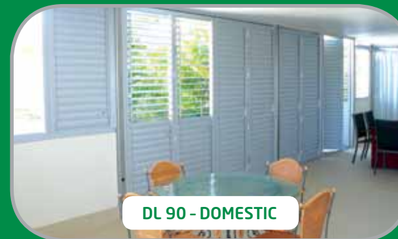
DL 90 - DOMESTIC