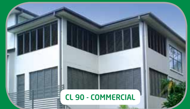
CL 90 - COMMERCIAL

OZROLL ELIPSO LOUVRE SHUTTERS ARE PRACTICAL YET STILL AESTHETICALLY PLEASING, MAKING THEM A PERFECT SOLUTION FOR MANY DOMESTIC OR COMMERCIAL APPLICATIONS.